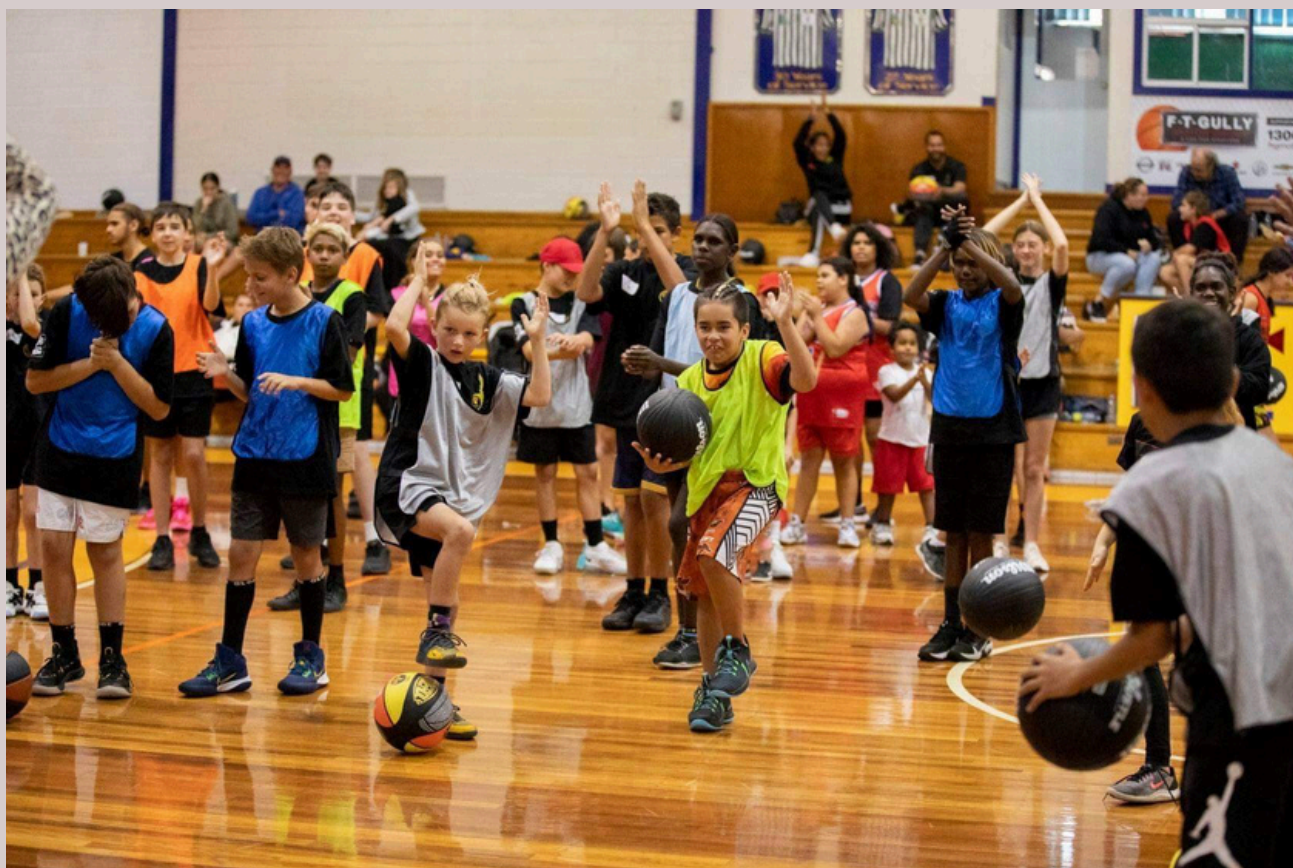
KBA basketball camp 2021